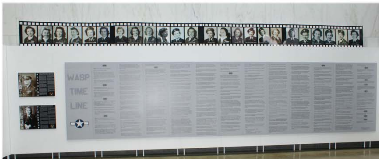
Twenty-six foot long WASP TIMELINE