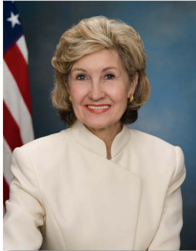
Senator Kay Bailey Hutchison

The Congressional Gold Medal is the highest and most distinguished award that Congress can award a civilian.