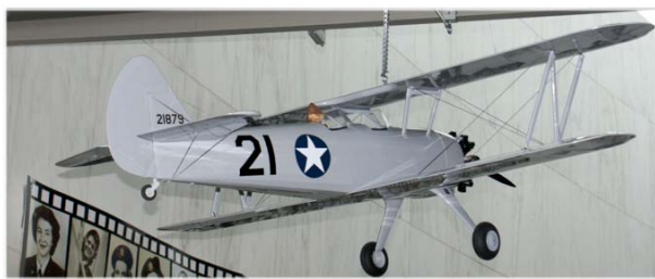
Historically accurate and beautifully re-created model of a PT-17. Handcrafted and donated by Roxanne Cotrell