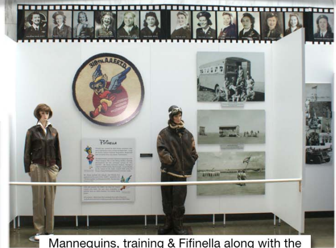
Mannequins, training & Fininella along with the WASP film strip, which runs 250 feet.