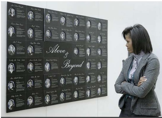
First Lady, Michelle Obama, visits Wings Across America’s “Fly Girls of WWII” display at the WIMSA Memorial. Photo: reading the "ABOVE & BEYOND" tribute to the 38 WASP and trainees who gave their lives flying for their country.

When I finished the training and graduated, I asked that instructor and two others to pose for a photo... which I have to this day. On that occasion I asked him “Have I lived up to my Mom’s reputation now?” He smiled and gave me a thumbs up and said “You’re getting’ there.”