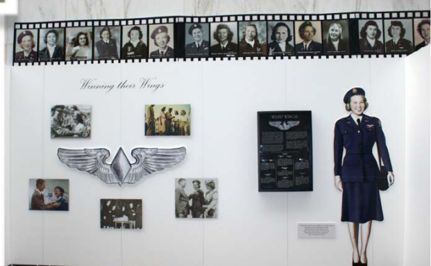
One of the WASP seven foot “STANDUPS.” Giant wings on left, life-sized silver WASP Wings in black box. Each pair crafted and donated by WASP Shutsy Reynolds.