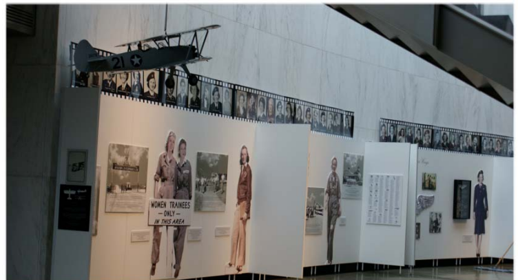
The WIMSA “GALLERY” where Fly Girls shines. Overhead the PT-17, on the walls ‘larger than life’ WASP standups!

‘Fly Girls of World War II’ shines a light on the untold, inspirational history of the pioneering Women Airforce Service Pilots of WWII, the first women in history to fly America’s military aircraft. These courageous women pilots are ‘larger than life’ in this colorful, visual history of the WASP: from the 200’ x 2’ WASP film strip, with the shining faces of 163 WASP, to the 7 foot tall WASP standups. Also featured in this educational exhibit : mannequins dressed in original uniforms, a visual history mural, photo collages, a 26 foot WASP timeline, a scale replica of the Stearman primary training aircraft (PT-17), and the unique WASP mosaic, which features the faces of EVERY WASP (1,102) in one amazing photo.